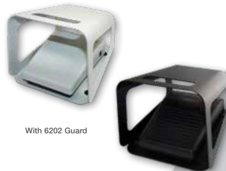
With 6202 Guard